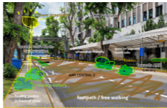
Screenshots from the online focus group discussions, capturing residents' views and suggestions